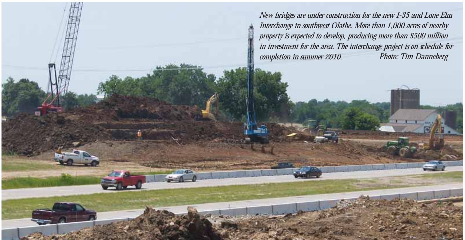
New bridges are under construction for the new I-35 and Lone Elm Interchange in southwest Olathe. More than 1,000 acres of nearby property is expected to develop, producing more than $500 million in investment for the area. The interchange project is on schedule for completion in summer 2010.

Arby's restaurant at 18615 W. 151st Street is under construction and is expected to open in late summer or early fall.