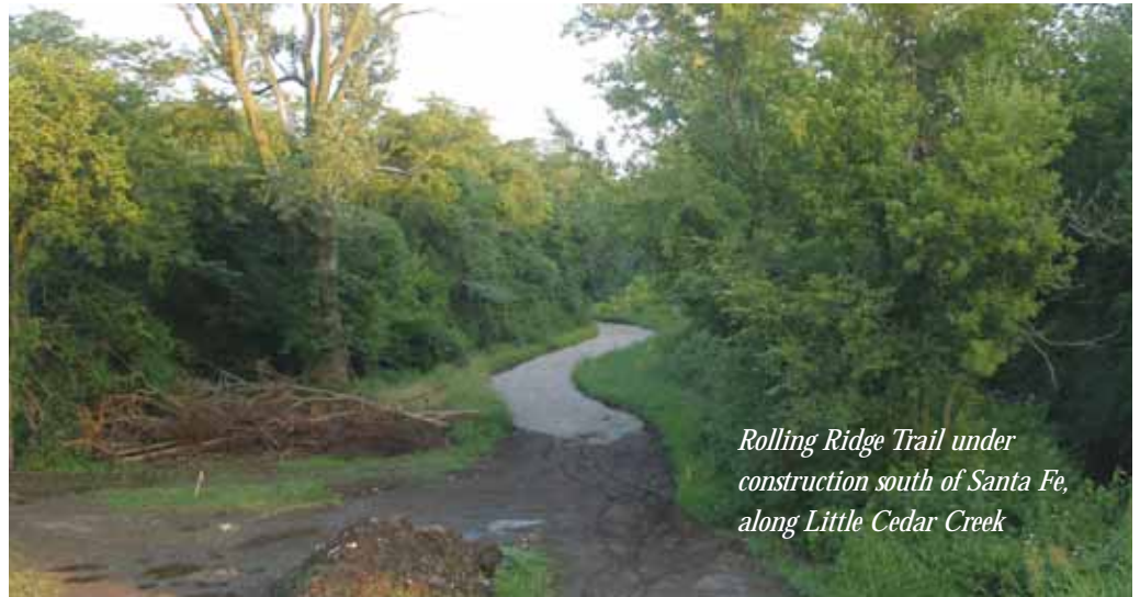
Rolling Ridge Trail under construction south of Santa Fe, along Little Cedar Creek

Pedestrians and cyclists can enjoy Rolling Ridge Trail before the end of the year. Most of the trail follows Little Cedar Creek, traversing approximately 2.3 miles on Olathe's west side. It begins at 131st Street and Hedge Lane on the north, connecting Ernie Miller Park & Nature Center and Prairie Center Park. South of Santa Fe Avenue, it connects Rolling Ridge Elementary School, ending at Oregon Trail Park on Dennis Avenue. Olathe park sales tax funds the trail's design cost and 10 percent of the project's $1.4 million construction cost.