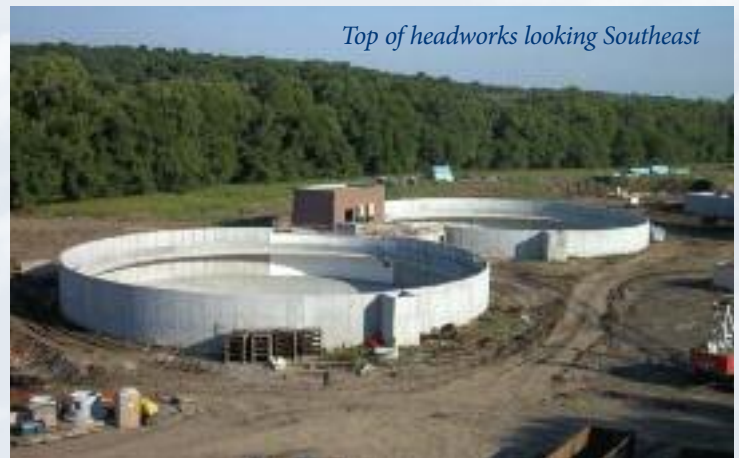
Top of headworks looking Southeast

The plant’s expansion increases dry weather flow capacity from 3 to 7.75 million gallons per day, and increases the wet weather peak flow to 23.25 million gallons per day. A 6 million gallon holding basin for heavy rain events will hold flow exceeding 23.25 million gallons per day until the plant flow decreases enough for treatment. The expansion will relieve the loading problem at the existing plant and open up the Cedar Creek watershed area for future development. The project is scheduled for completion by December 2012, but if the weather cooperates it may be finished earlier.