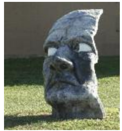
The sculpture Avoidance, by E.S. Schubert, is part of the artist's series featuring studies of figures that are avoiding the gaze of the view. The piece is located in downtown Olathe at the corner of Santa Fe and Water Streets.

Visit OlatheKS.org/GIS/SculptureMap for a map of the walking tour, or contact the Parks & Recreation office, 913-971-8563.