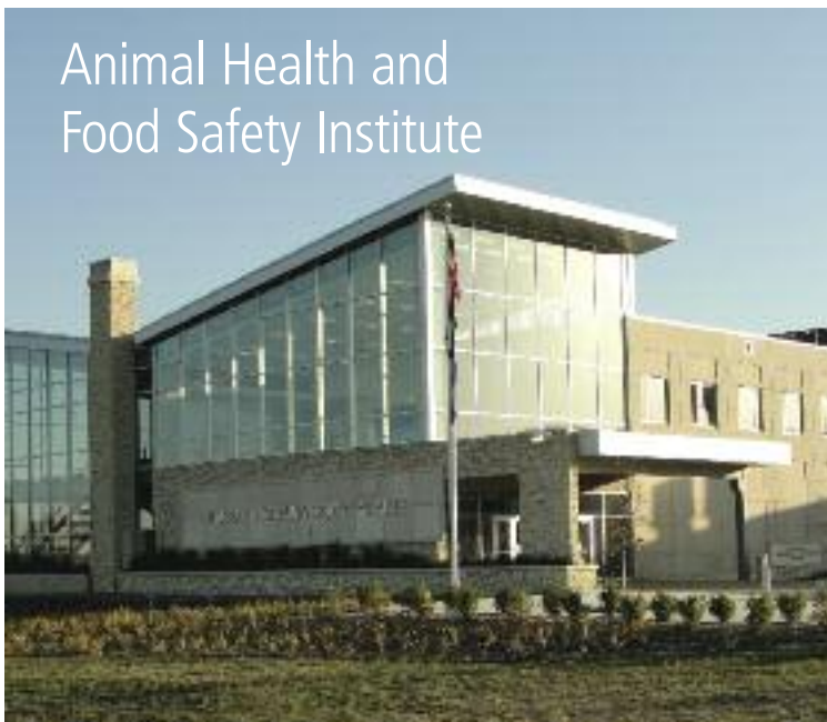
Animal Health and Food Safety Institute

Earlier this year, the K-State Olathe Innovation Campus hosted a grand opening of the campus located just east of Highway 7 on College Boulevard. The campus' first building, the International Animal Health and Food Safety Institute, will house research, education and outreach programs in its laboratories and classrooms. The building was made possible with the City of Olathe's donation of land for the campus.