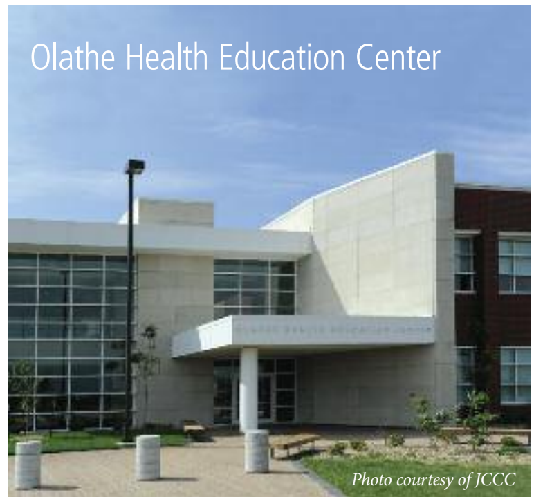
Olathe Health Education Center