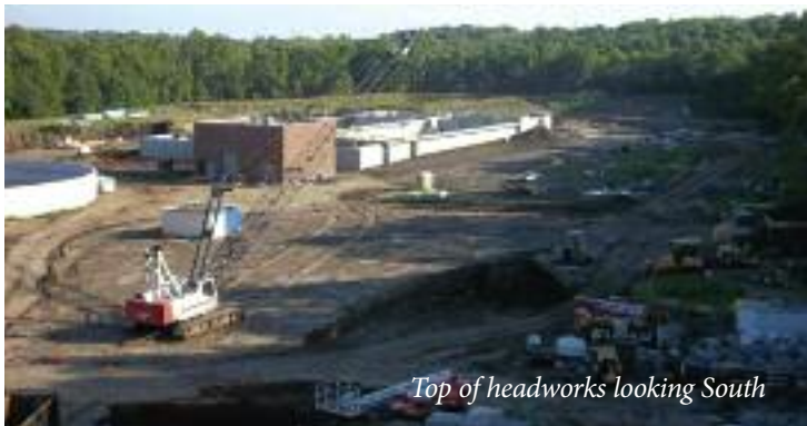
Top of headworks looking South

One of the City of Olathe’s largest projects to date is the Cedar Creek Wastewater Treatment Plant expansion, located west of 7 Highway at the end of 119th Street. The construction, which began in June 2010, is ahead of schedule and continues to take shape.