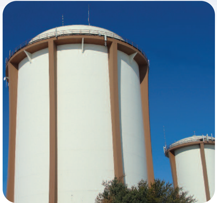
The larger water tower near 151st and Black Bob Road will receive cleaning and maintenance this spring as the City of Olathe preserves your "liquid" assets.

For a complete list of items accepted, see www.OlatheKs.org - click on Municipal Services, then Household Hazardous Waste.