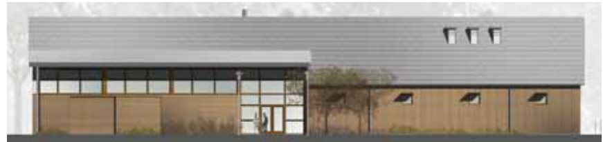
Artist's rendering of the east elevation of the Heritage Center.

Put April 21-22 on your calendar now for our 11th annual Civil War on the Border event. This year, battles will be fought south of Kansas City Road in Stagecoach Park. Parking is again planned for Olathe North High School, with free shuttle buses operating between Mahaffie and the school parking lot. We hope to see you in April!