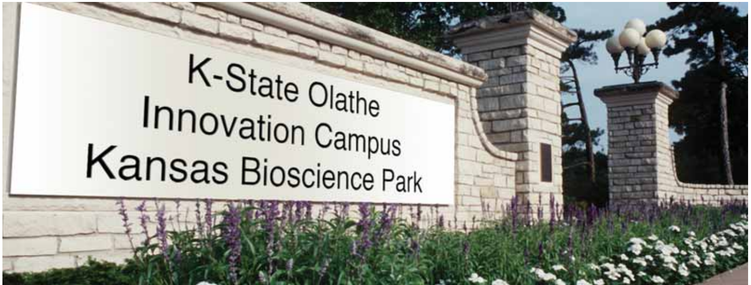
Entry sign concept for the planned Kansas State University-Olathe Innovation Campus and Kansas Bioscience Authority Science Park.

Beginning July 20, view the fall issue of the ActiveLife Recreation Catalog at www.olatheks.org/ActiveLife . If you would like a free subscription to ActiveLife, contact the Olathe Parks & Recreation Department at 913-971-6263.