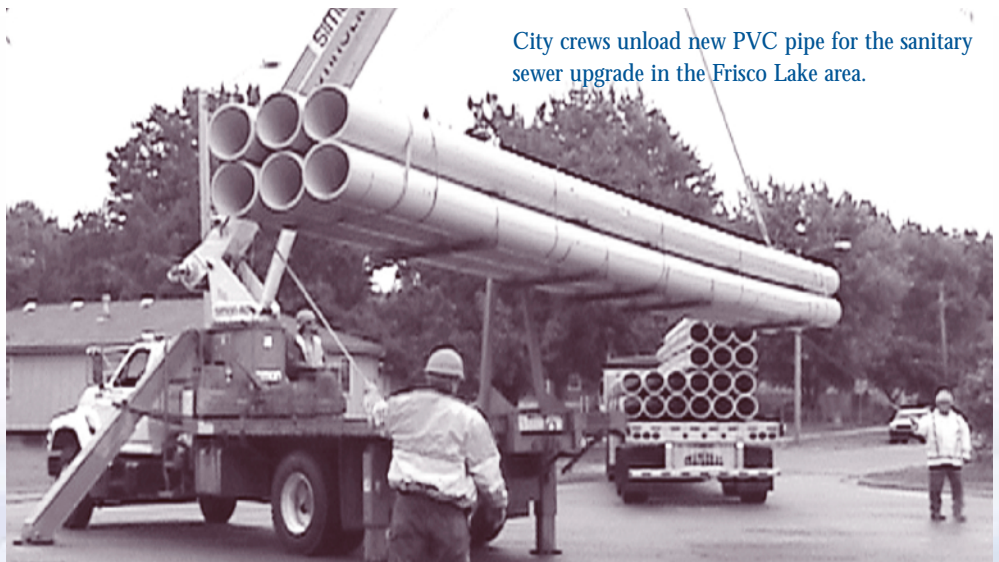
City crews unload new PVC pipe for the sanitary sewer upgrade in the Frisco Lake area.

The City completed approximately 1,000 feet on this project using pipe bursting, a new, "trenchless" construction technology in which a larger diameter pipe is pulled underground through the existing sanitary sewer, thereby reducing the need to "open cut" the entire length of the sanitary sewer rehabilitation. Pipe bursting was used due